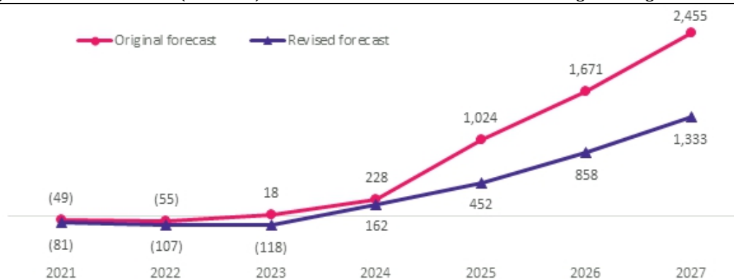
Figure 1: EBITDA forecast ($ millions) – current forecast vs. forecast at time of original merger announcement

As announced on May 24, 2021, Momentus is standing down its flight plan for 2021 as it works to thoroughly address the U.S. government’s national security concerns. Under Momentus’ revised business plan, the inaugural flight of Momentus’ first two Vigoride orbital transfer vehicles is now anticipated to occur in June of 2022, contingent upon Momentus’ ability to secure the necessary government launch licenses and approvals and slots on the launch provider’s manifest. This represents an approximately 18-month delay relative to Momentus’ expectation from the time of the original merger agreement. Momentus has revised its long-term financial forecast to reflect this shift in schedule, along with other changes to its operating assumptions (please see Figure 1).