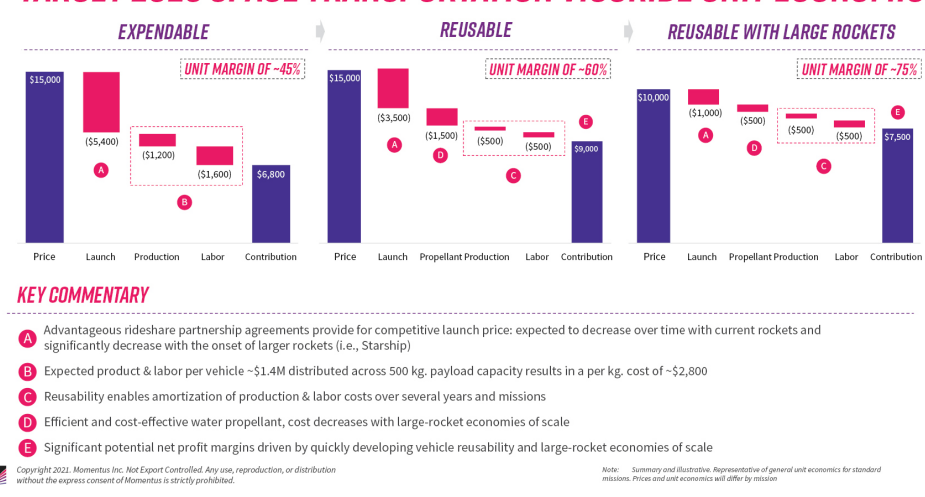
Illustration of Space Transportation unit economics